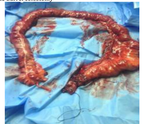
Pan proctocolectomy with end ileostomy of FAP patient with high-grade dysplasia

Table 4) Distribution of the degree of differentiation according to age in both genders